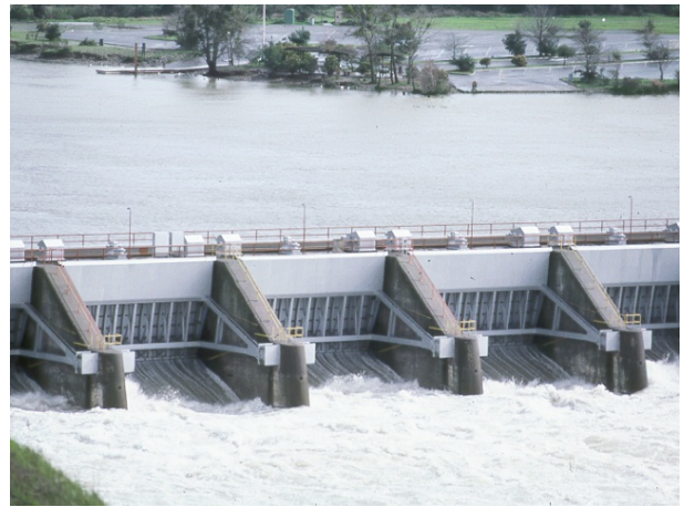
Nimbus during flood operations

Nimbus Dam, located 7 miles downstream from Folsom Dam, is a regulatory dam that controls the flows into the lower American River. It is visible from Hazel Avenue and the California State University – Sacramento Aquatic Center north of Highway 50