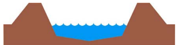
American River Channel

Heavy rain and inflow into the reservoir could lead to use of Folsom Dam's outlet works – eight tubes that go through the dam, with a capacity of 27,000 cfs. The spillway gates can be used at this lower range for management of the dam's water level.