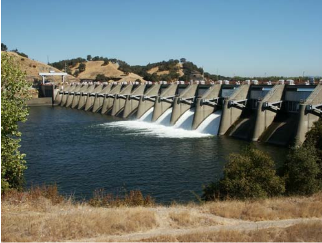
Nimbus normal operations

Nimbus Dam, located 7 miles downstream from Folsom Dam, is a regulatory dam that controls the flows into the lower American River. It is visible from Hazel Avenue and the California State University – Sacramento Aquatic Center north of Highway 50